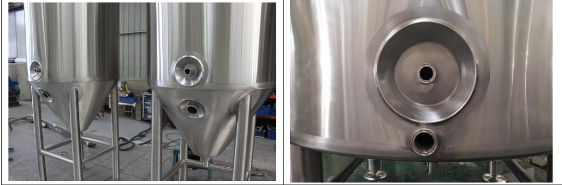
d) Glycol port

No. 2609, Pharmaceutical Logistics Park, Zhuangjian Road, Kuiwen Dist., Weifang, Shandong, China (Mainland).